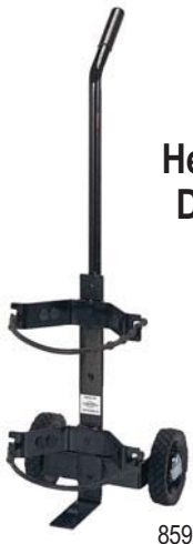
Heavy Duty Dolly Cart