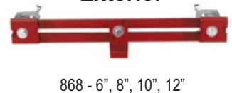
868 - 6", 8", 10", 12"