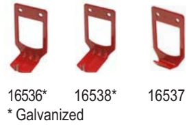
16536* 16538* 16537 * Galvanized